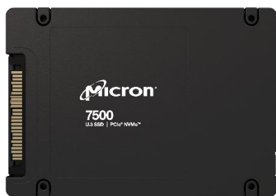
Micron 7500 NVMe SSD (U.3/U.2), 15mm

The 7500 SSD is a versatile solution that delivers the performance required by complex and critical business workloads.